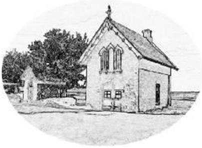
Chapel of Santa Maria - The First St. Mary's